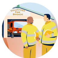
Disaster relief & emergency services