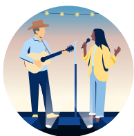
Arts, culture & events