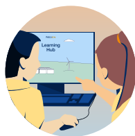
Education & training