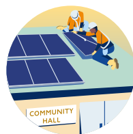
Energy efficiency & environment