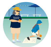
Aged care, health & well-being

If you'd like more information or need assistance preparing or submitting your application, drop in and see Fiona at the Neoen office on Tuesdays or Wednesdays, or call 1800 966 166 .